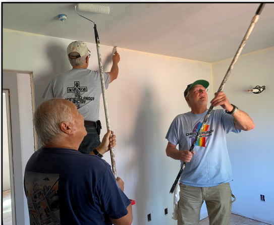
Working in Paradise!