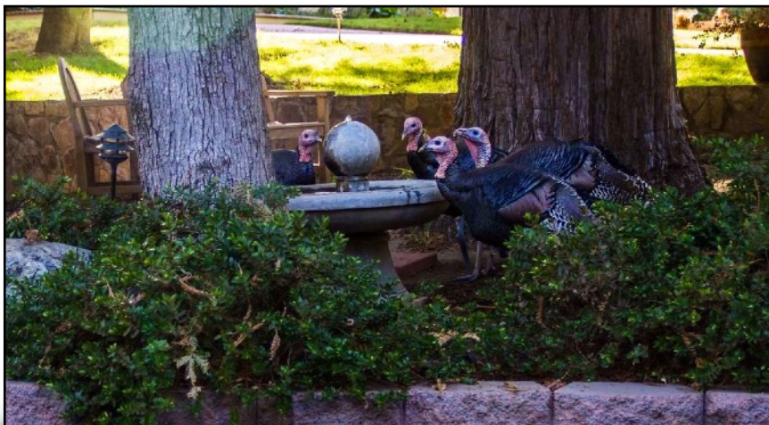
SPECIAL FRIENDS OF CHRIST THE KING!

Registration for Spring Fling Coming Soon!