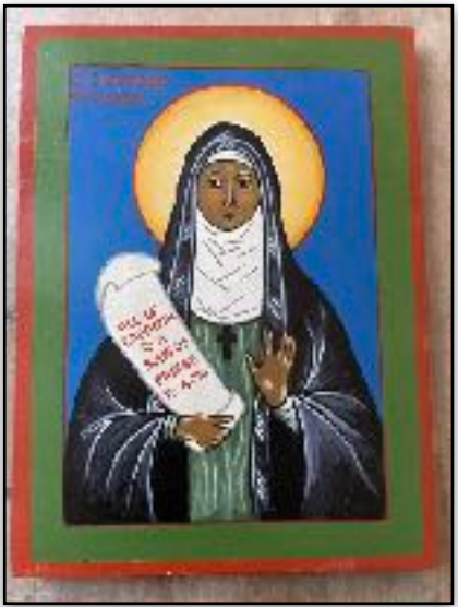
Hildegard of Bingen

WHAT ARE THEY UP TO NOW??? THE ART OF BECKY GOODWIN PAM ABBEY, INTERVIEWER