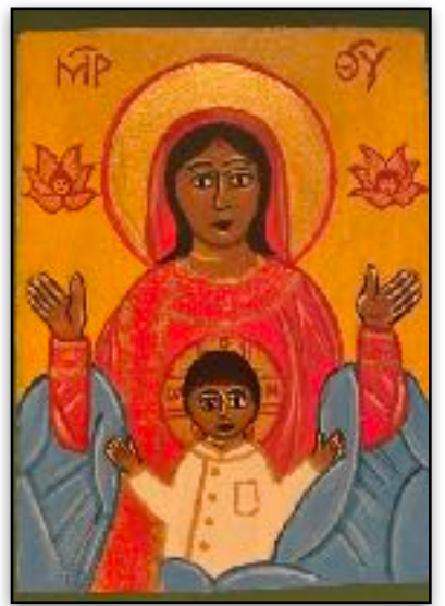
Madonna and Child