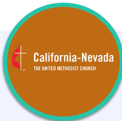
Cal-Nev Annual Conference

The Commission on the General Conference has announced that the postponed General Conference will take place on Aug. 29 - Sept. 7, 2021 in Minneapolis, Minnesota.